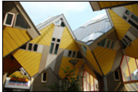
Cubic House, Netherlands