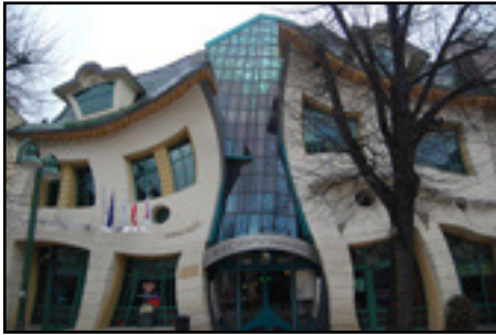
Crooked House, Poland

Over the years I have collected a very large number of photos. They are actually in a file titled "Weird Buildings," but I thought a more appropriate title would be "Interesting Buildings." My intention is to publish a couple each month. If you have pictures that have piqued your interest, email them to me, and I will add to the file and the newsletter.