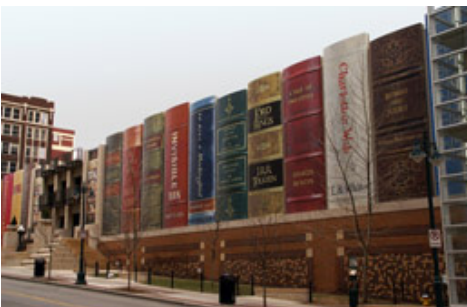
Kansas City, Mo., Central Library parking garage

Over the years, I have collected a large number of "interesting building" photos. If you have picture(s) of building that have piqued your interest, email them to me and I will add to the file and the newsletter. Send to Rstuart17@cox.net