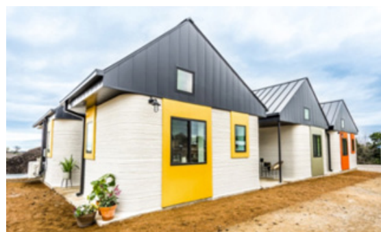
ICON delivered 3D printed homes to house homeless.

■ Builderonline.com , May 4, 2020. “Buyer demand and healthy housing-market dynamics will prevent U.S. home prices from dropping more than 2%-3% —or more than 1.7% year over year—in the wake of the coronavirus, according to a forecast released today by Zillow. The forecast says home sales will fall as much as 60% this spring and take through the end of next year to recover, while prices will fall through the year but recover a few months sooner.” https://bit.ly/2LaPVhE ❖