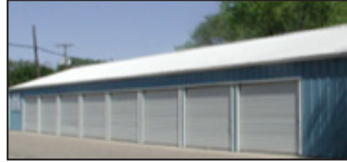
Valuation of Self-Storage Properties

And so many more! Check out all of our workshops at www.teamconsulting.cc