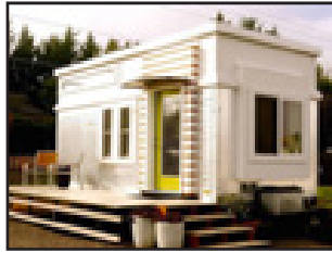
Unique & Challenging Homes