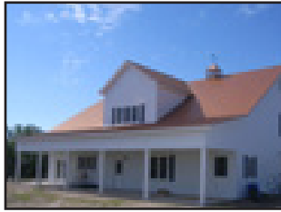
Valuation of Barn Conversions