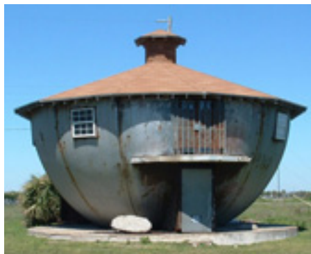
Kettle House, Galveston, Texas. Note: This unique home has been remodeled and was featured in the DIY Network show "Big Texas Fix" in May.