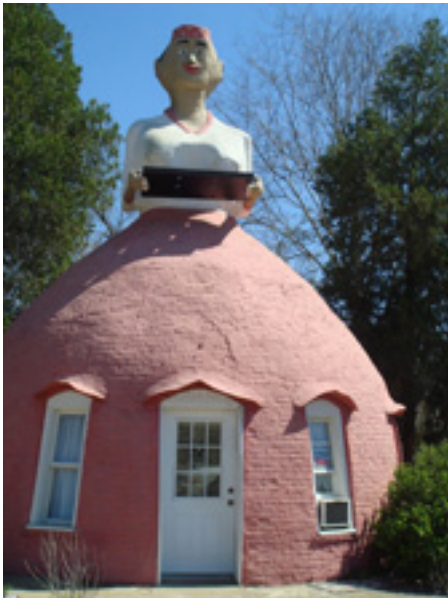
Mammy's Cupboard, Natchez, Miss.

Over the years I have collected a very large number of photos. They are actually in a file titled "Weird Buildings," but I thought a more appropriate title would be "Interesting Buildings." My intention is to publish a couple each issue. If you have picture(s) of building that have piqued your interest, email them to me at my new email address : r17stuart@gmail.com. I will add to the file and the newsletter.